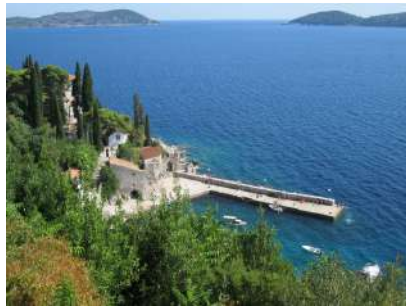
Arboretum, Dubrovnik, Croatia