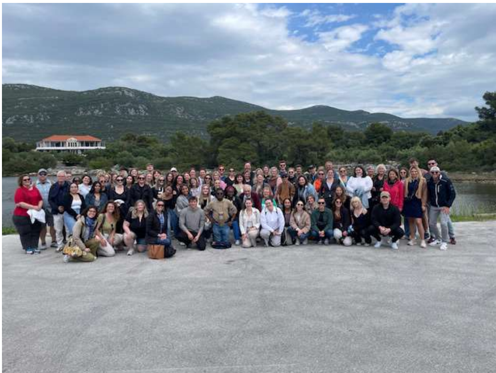
The 2024 Dubrovnik Course Participants